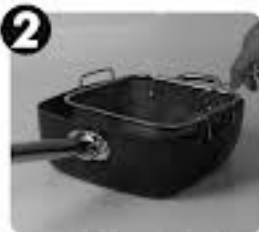
Insert The Fry Basket Into The Pan By Placing It Along The Edge