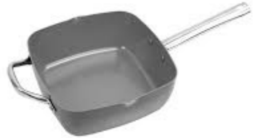
9 1/2" Square Pan