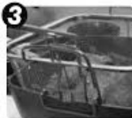
The Fry Basket Can Be Placed Into The Pan At Two Levels. The First Level Is Used When You Are Frying Something. You Can Raise The Fry Basket To The Second Level When You Are Finished Cooking As This Drains Out The Oil