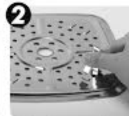
Pinch The Legs And Insert It Into The Holding Slots On The Bottom