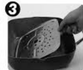
Place Steam Rack On Bottom Of Pan When Using To Cook