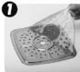
Peel Off The Protection Foil On Both Sides