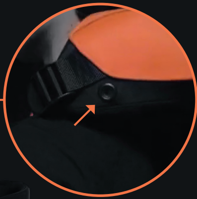
Charging Port (Back)